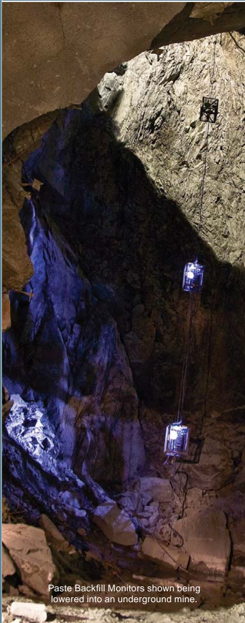
Paste Backfill Monitors shown being lowered into an underground mine.

RST's Paste Backfill Monitors are used in mine paste backfill to achieve improved extraction and to increase safety. They provide useful engineering feedback to allow paste and stope design to be optimized.